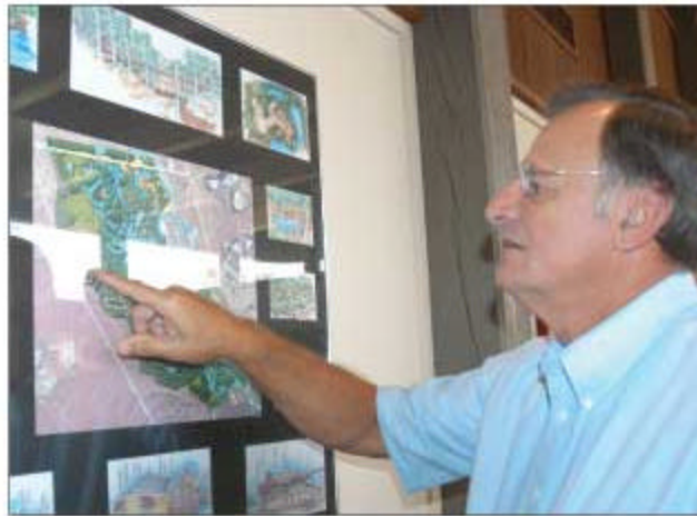
Sen. Ben Nevers of Bogalusa looks at plans for Bogue Chitto State Park.

Two months later, Hurricane Katrina blew all schedules into a holding pattern. But now the bids are in, and State Sen. Ben Nevers said if he and Rep. Harold Ritchie can secure an additional $5 million from the state's Capital Outlay Budget this month, the project